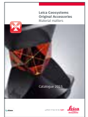
Leica Original Accessories